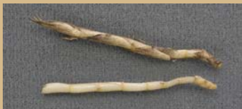
Roots with scales intact (top) removed (bottom)