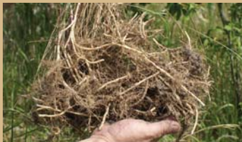
Dense Root Mats